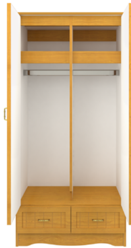
Model: COALZ 34.5W 23.75D 71H

Kwalu's Cotswold Dementia/Alzheimers Wardrobes are thoughtfully designed to support resident independence and safety. Light colored interiors help with spatial orientation. Features include softly rounded edges and waterfall detailing. Hidden door latches and passive locks allow caregivers exclusive access. Choose from dozens of hardware styles, including ADA-compliant.